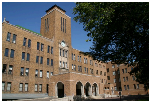
Figure 2: Hokkaido University

Please submit via web by 31, Oct., 2014.